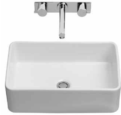
Supplied with chrome flush fitting waste and white plug.